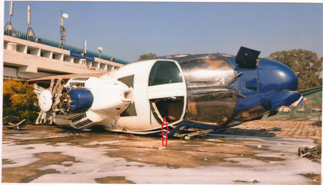
Picture : The Cockpit Crew was rescued after breaking the Plexi

Both the cockpit crews were rescued from the helicopter after the accident and were immediately rushed to the hospital for medical assistance. Both the crew sustained minor injuries.