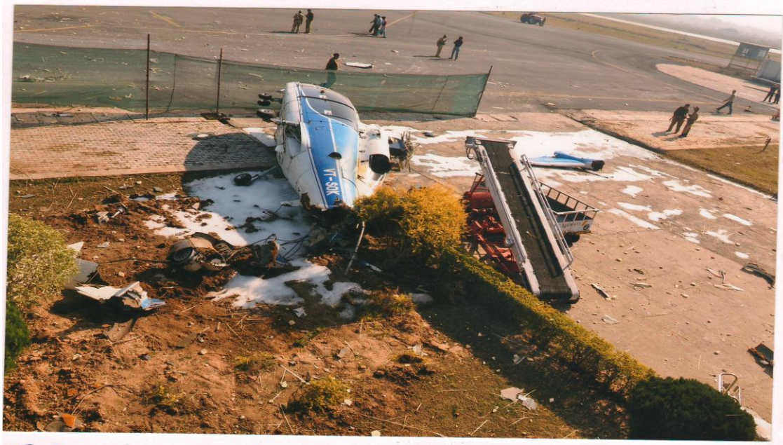
Picture: As a precaution fire vehicles sprayed foam since fuel was leaking