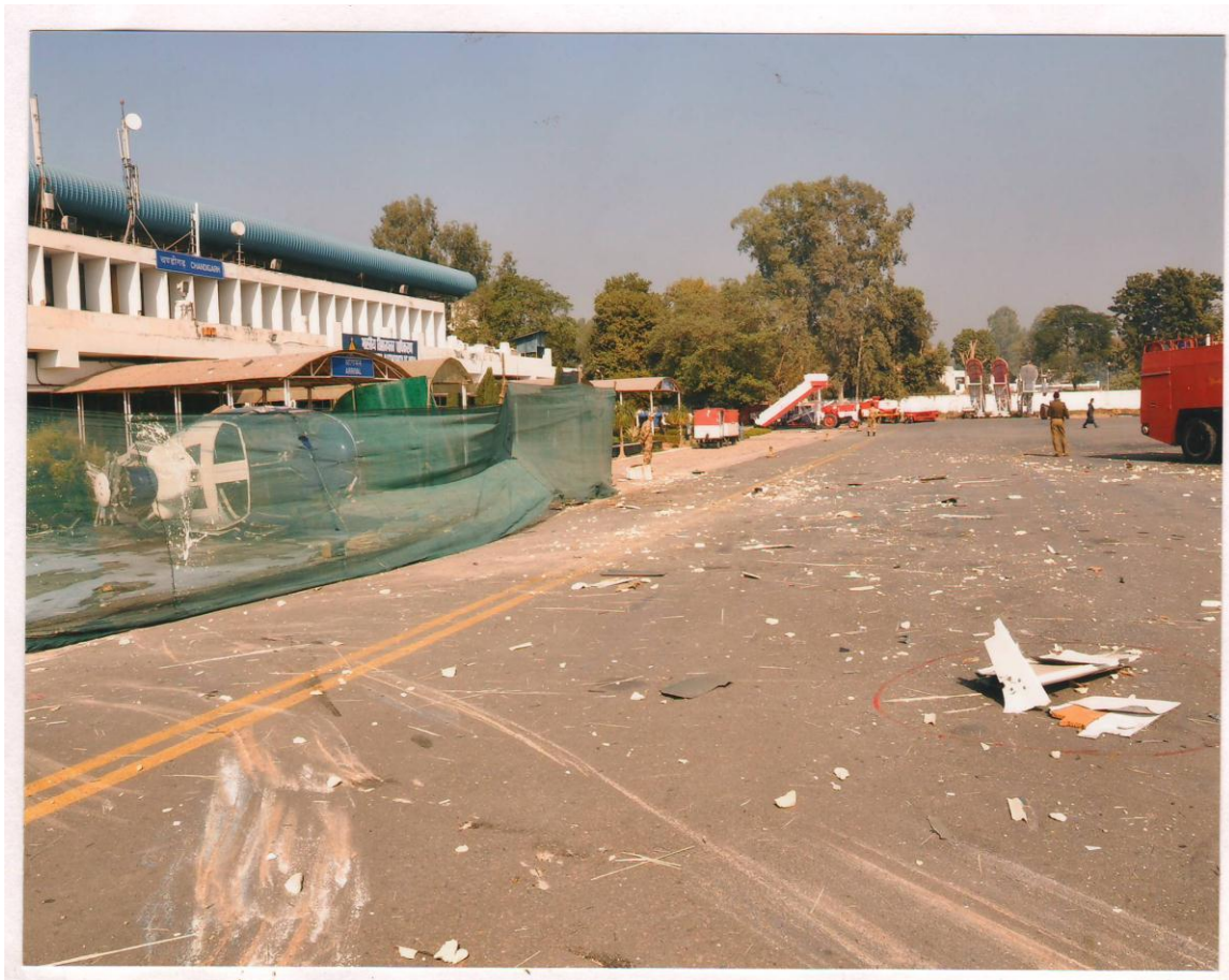
Picture: Helicopter rubbing marks and debris scattered on the apron

After examining the apron area it was observed the helicopter was parked on the apron with its nose gear on to the slope area. After the engine start up the helicopter rolled forward for few feet and then took a left turn as a result the RH main gear came to the slope area. Thereafter tail boom composite pieces were observed on the apron area and the main rotor hitting marks on the apron surface were observed in continuous pattern. Once the main rotors impacted the apron surface the composite structure disintegrated into small pieces and scattered all over the apron area as shown in the pictures. Thereafter the helicopter rolled over on to its left side and then skidded on its right side before coming to final rest position about 20 mts from the terminal building.