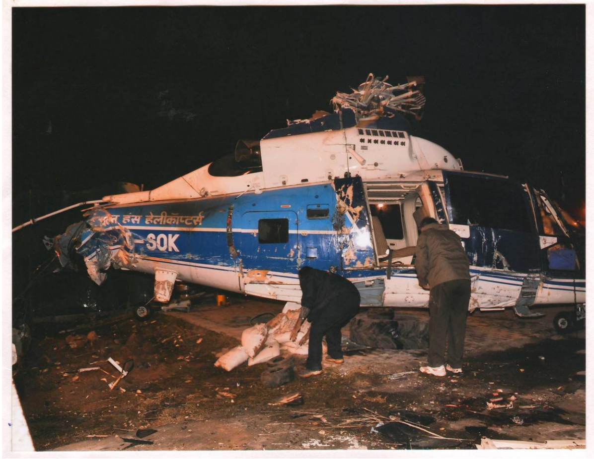
Picture: Side view showing damage on Right Side

In the cockpit, the fuel levers were found in off positions and the rotor blades were ON. The helicopter batteries were found in off position. Since both the doors were damaged the RH overhead plexi was broken and both the pilots were rescued from the helicopter.